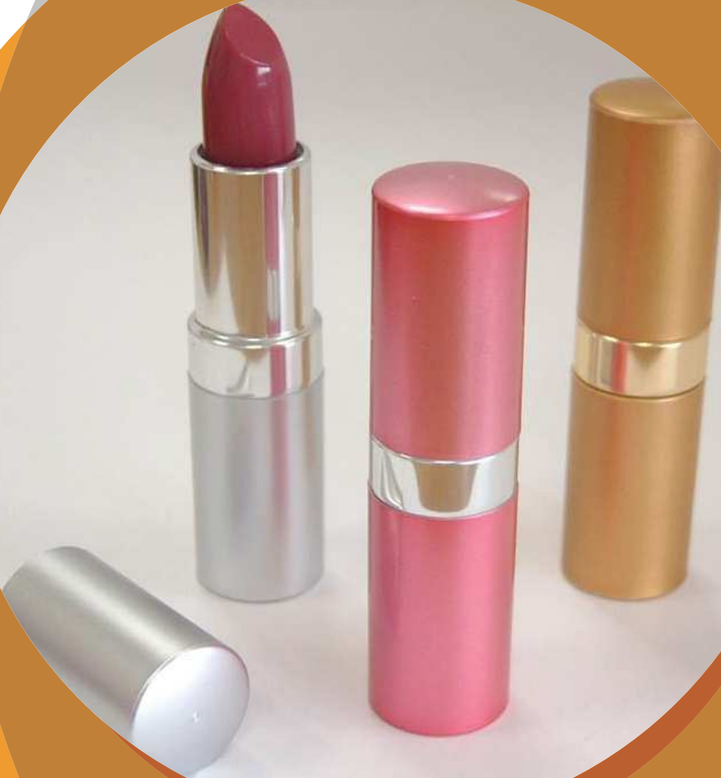
Image shown with Lacquering